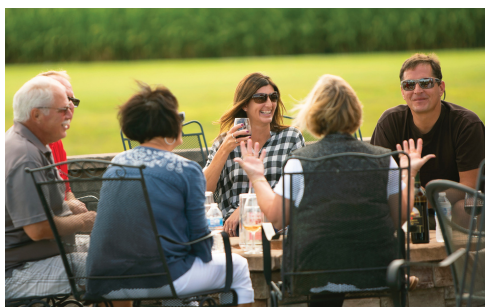
SYCAMORE LAKE WINERY sycamorelakewineco.com