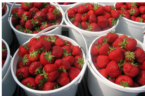
SUTER PRODUCE & FARM suterproduce.com

Take a leisurely and fragrant stroll through the Stratton Greenhouse, one of Ohio's largest retail displays of poinsettias at holiday time, and geraniums and hanging baskets of every variety in the spring. If you venture downtown you can find their outlet shop "Roots By Stratton" with gardening, gifts and greenery. For a group, you may request workshops and lectures on gardening topics and techniques.