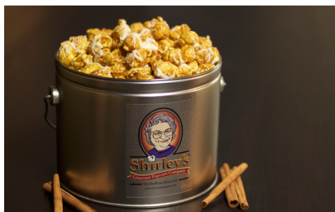
SHIRLEY'S GOURMET POPCORN shirleyspopcorn.com

Call us for planning assistance at 419-222-6075. VisitGreaterLima.com