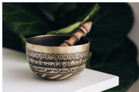
TEN THOUSAND VILLAGES tenthousandvillages.com