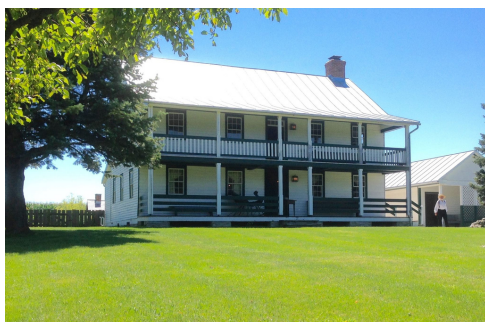
SCHUMACHER SWISS HOMESTEAD swisshistorical.org